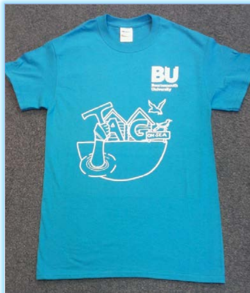
TAG T-Shirt £10

Limited availability for all you TAG collectors and newbies out there.